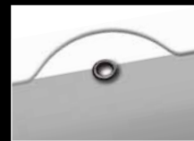
Calendar with hanger ...