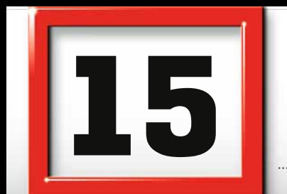
Date cursor and numbers in original size.